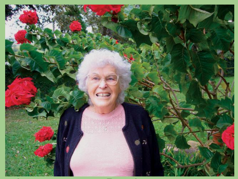
Acampamento Betel Established in 1948